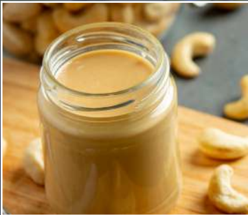
Valued Added Products